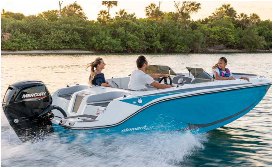
Element M17 Deck Boat